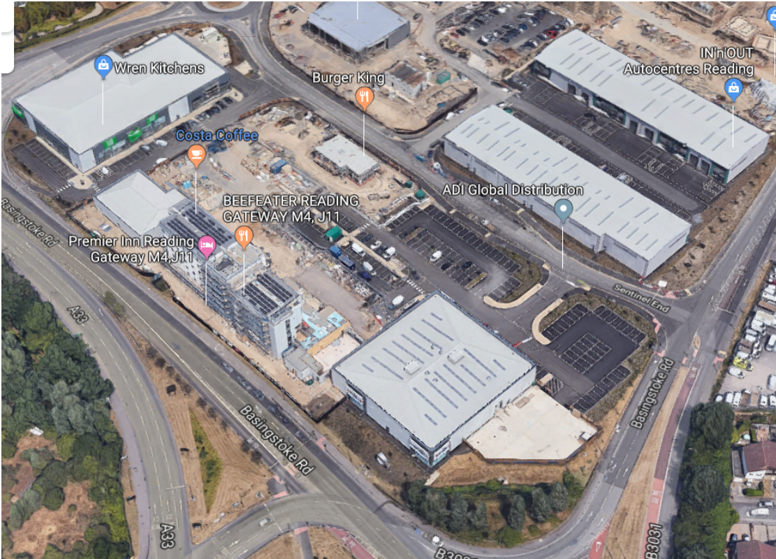
Aerial view looking south